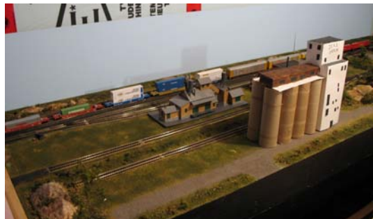
Close up of the Zeke Grain module.