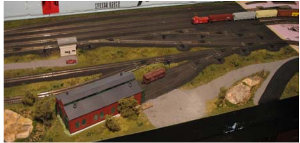
The East Yard module close up.