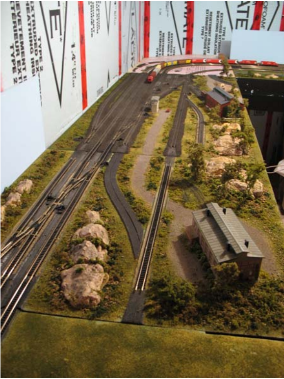
The East Crossover module (front) and the East Yard module (rear) along the left wall of the train room. The permanent corner in the far corner of the room contains all the yard tracks and continues the yard around the corner.