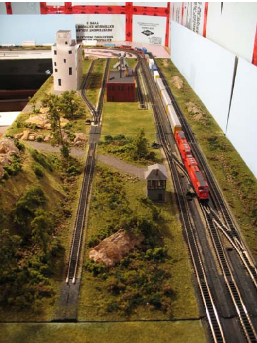
The Zeke Grain module (rear) and the West Crossover module along the right wall of the train room.