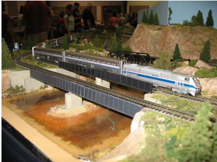
Keenan's Amtrak train running across one of the bridges on the Feather River Falls module.

Here are some photos of the Modular Layout at the Muskoka Train Show.